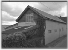
The Brick Barn, EX4 2JH

Comprising ground floor warehouse/storage/office space with kitchen area and WC. First floor open-plan office area, plus additional outbuildings.